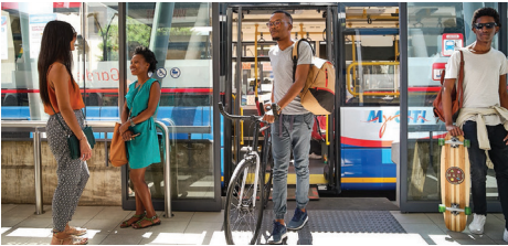
Ukungena lula kwezitulo zabo bakhubazekilekileyo, ipremu kunye neebhayisikile.

Umsebenzi wale projekthi ubukhulu becala uxhaswa ngemali ngurhulumente kazwelonke.