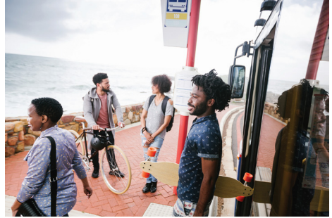
ISigaba 2A seeNkonzo zeMyCiTi siza kudala iindlela ezintsha zokuya emsebenzini, esikolweni nakwiindawo zolonwabo.

ISixeko saseKapa saphumeza imigaqo yebhasi kunye neendawo zezikhululo zazo emva kokuthethana noluntu ngo2015. ISigaba 2A siza kuthatha iminyaka embalwa eyongezelelweyo phambi kokuba sigqitywe, kodwa ukwenziwa kweendlela kuza kuqalisa kwakamsinya eGovan Mbeki Road phakathi kweJan Smuts Drive neOttery Road.