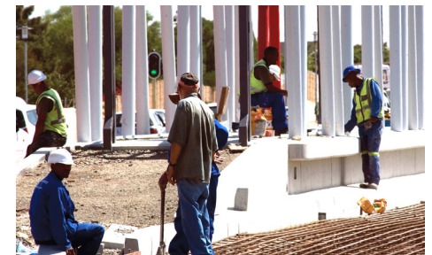
Umsebenzi uya kwenzeka ngokwezigaba kwaye izithuthi ezindleleni ziya kubekwa iliso ngamaxesha onke, kodwa ingxinano yezithuthi ilindelekile.

ISixeko siyakuqonda oku kuphazamiseka kwaye sicela ukuba bonke abo bachaphazelekayo babenomonde, njengoko isiphumo iluthutho lukawonkewonke olungcono, ukuhamba kakuhle kwezithuthi, ukuphuculwa kweendlela zabahambi ngenyawo nezebhayisekile, notyalomali kwiindawo ezingqongileyo ukuze kuxhamle izizukulwana ezizayo. Sayina ungene ukuze ufumane ulwazi oluthe vetshe- jonga iinkukacha kwiqweqwe elingasemva.