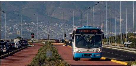
Iindlela ezikhethekileyo zinciphisa ixesha lokuhamba.